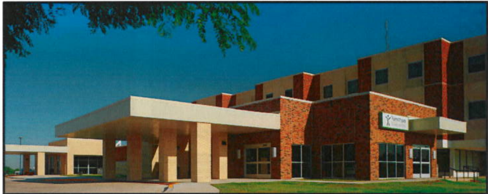
Newman Memorial Hospital 905 Main St, Ok 73858 580-938-2551